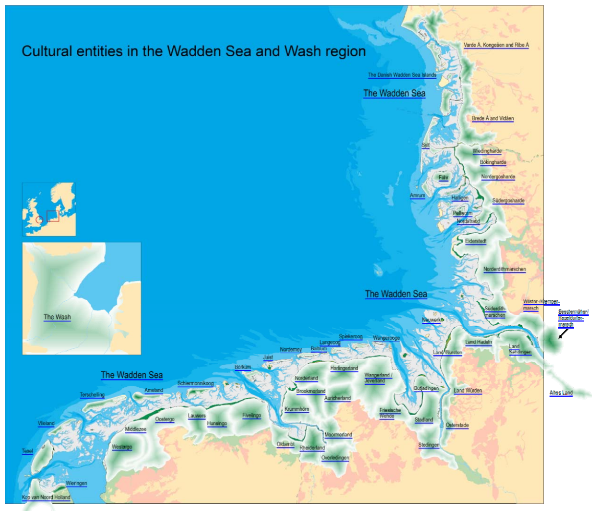
Figure 2: Map of the described Cultural Entities in the Wadden Sea Region

the LancewadPlan is truly unique. There is no other such area in the world and it must be considered outstanding on the global level.