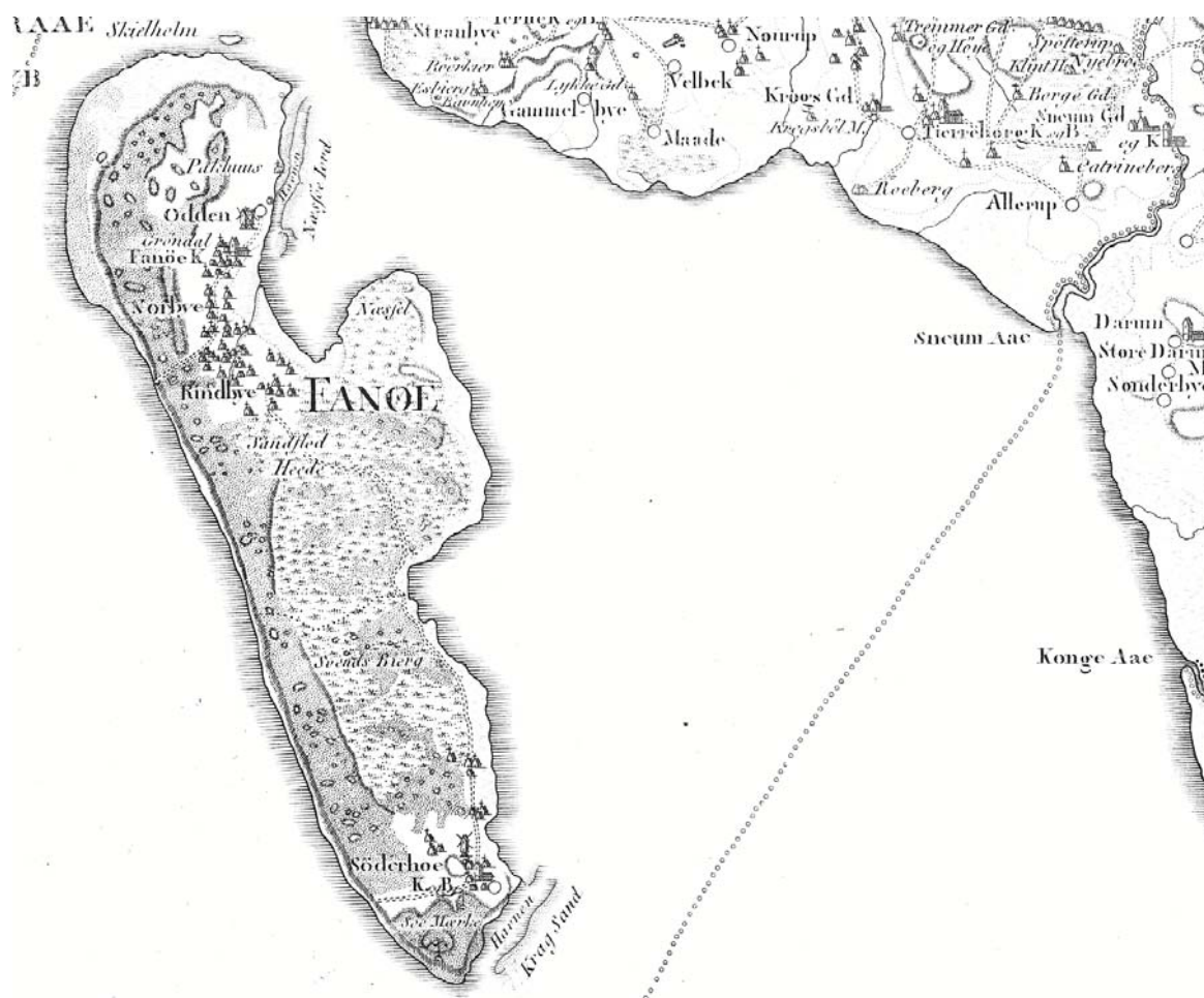
Figure 3: The historical map of Fanø shows the natural landscape and its use

From these descriptions a picture emerges of a cultural landscape, comprising diversity within an overall uniformity, on an unprecedented spatial scale. In total it covers an entire coastal region over a distance of almost 1000 km. Similar patterns can be identified: these are most pronounced in the dwelling mounds, the same embankment history is evidenced by the thousands of kilometres of dikes and the way in which the water has been managed over a 1000 years. There is the same evolution in agricultural practices and the way in which they have shaped the present landscape, similar evolution in the cities, towns and villages, all reflecting man's encounter with very specific environmental conditions basically confined to this region.