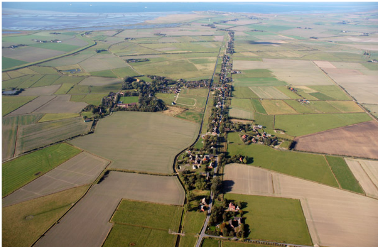
Figure 6: Fahretoft-Hollaenderdeich

It is essential therefore, not to see this work as a finished project but as a continuing process. There will need to be continuing co-operation at the regional level, especially in a trans-boundary context, and in addition there should be the promotion of work at a more regional and local level which would feed back into the trans-boundary work.