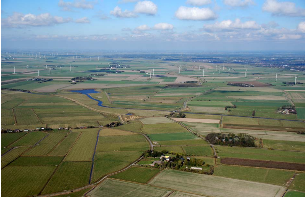
Figure 4: Hattstedtermarsch-Reußenköge