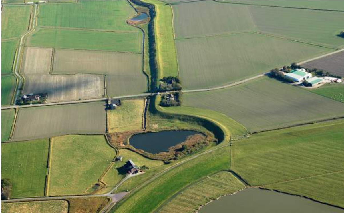
Figure 5: Ockholmer Koog and Sönke-Nissen-Koog